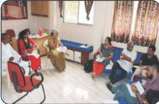
CAH Project Review Meeting at DISHA Kendra Block Karjat District Raigad on 9/1/2021