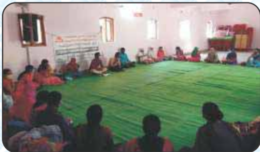
State Level Meeting in action - 15/2/2021 Jagnade Hall Block and District Chandrapur