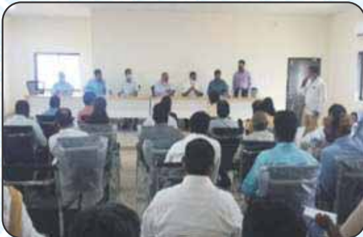
BISLD Participation in District Collector meeting on at Palghar for brief about CAH project on 12/1/2021