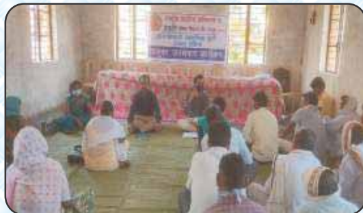
JIVATI Block JANSAMVAD District Chandrapur on 25/3/2021