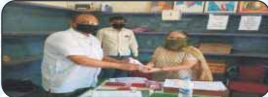
Distribution of Food Grains/Dry Ration and Medical Accessories to Jawaharlal Nehru Udyog Kendra Govt Boys Observation Home 22/05/2020