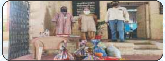
Distribution of Food Grains/Dry Ration and Medical Accessories to Govt. Girls Observation Home Mundhwa Pune on 22/05/2020.