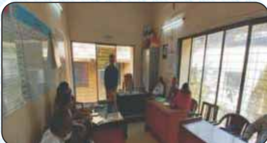
District Level Meeting at Panchayat Samiti Alibaug District Raigad on 10/3/2021