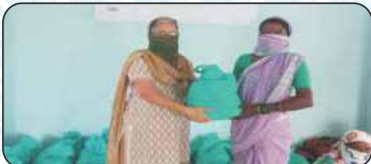
Distribution of Dry ration at Samtanager, Village Tardobachiwadi, Block Shirur, District Pune