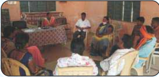
Capacity Building Workshop for District Supervisor and Block Coordinator at Sub Center Kitali, PHC Waddha, Block Armori, District Gadchiroli on 13/02/2021