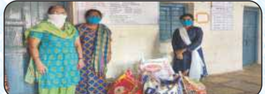
Distribution of Food Grains/Dry Ration and Medical Accessories to Sarvesha Seva Sangh Vadagaon Budruk District Pune on 23/05/2020