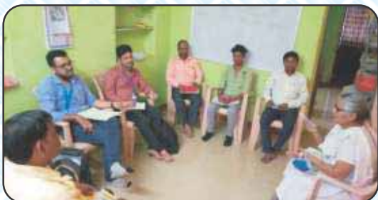
State Nodal NGO Project Team STAPI and Nandurbar District Project Team during Project Review Meeting at Janarth Adivasi Vikas Sanstha Block and District Nandurbar on 17/2/2021