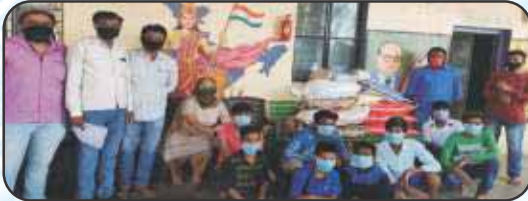
Distribution of Food Grains/Dry Ration and Medical Accessories to Saraswati Aanath Shikshan Ashram Dapodi District Pune 22/05/2020.