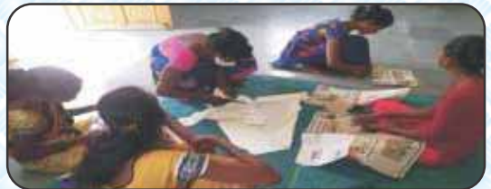
Six Women from Mahalaxmi SHG in mask stitching training on 9/3/2021