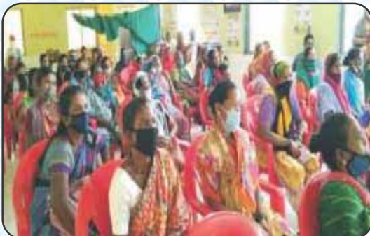
DISHA Kendra Karjat, Block JANSAMVAD at Kadav Primary Health Care Center on 26/3/2021