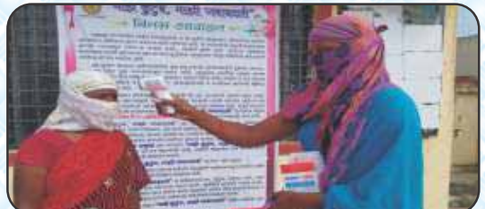
Adherence of "My Family My Responsibility" during COVID-19 Pandemic Self Help Group at Samtanager, Village Tardobachiwadi, Block Shirur, District Pune