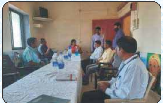
RKS Meeting at Nandgaon PHC Block Jawhar District Palghar on 10/2/2021