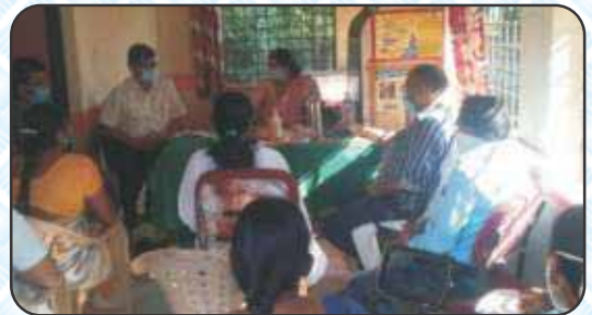
Rugna Kalyan Samiti Meeting at Primary Health Care Center, Vairagad Block Armori District Gadchiroli on 19/3/2021