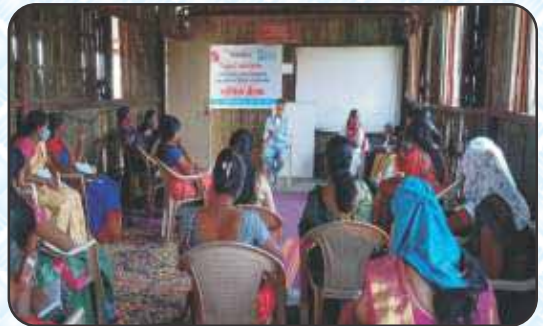
Members of SAKHI Group discussions about CAB Appropriate Behaviour at LOKPANCHAYAT District Ahmednagar on 27/3/2021