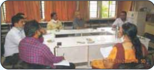
STAPI Team during the after care programme support service for young adult orphans discussions with the Officials of Maharashtra State Probation and Aftercare Association at STAPI on 18/9/2020