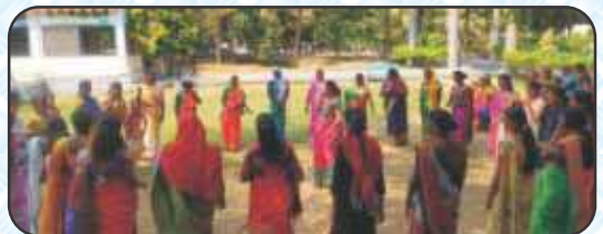
Capacity Building Training of Self Help Groups at Shivtara Krushi Paryatan Kendra village on 15 /3/2021