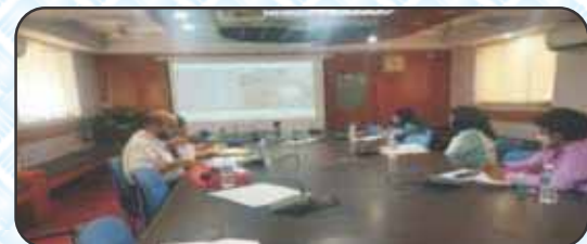
District Level Meeting at Zilla Parishad Thane on 24/3/2021 Seen in the photograph:-