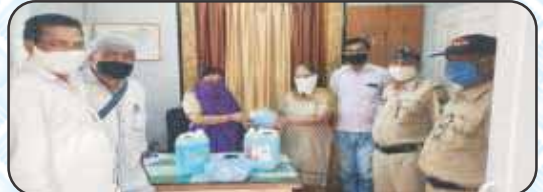
Distribution of Medical Accessories to Open Jail Yerwada on 22/05/2020