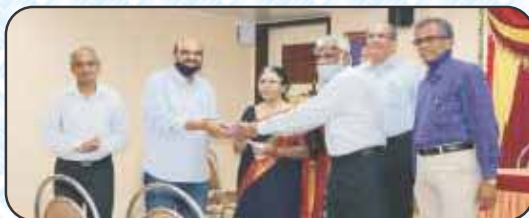
CAH Project kick off Meeting at Maharashtra Seva Sangh Mulund Mumbai, on 7/1/2021