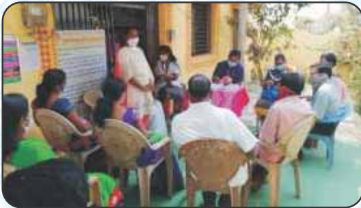
Visit of Block Health Officials at Dogargaon Sub Centre Block and District Gadchiroli on 9/3/2021