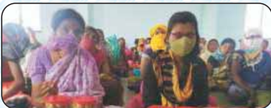
Nnutritious food distribution to SHG Members on 11 /3/2021