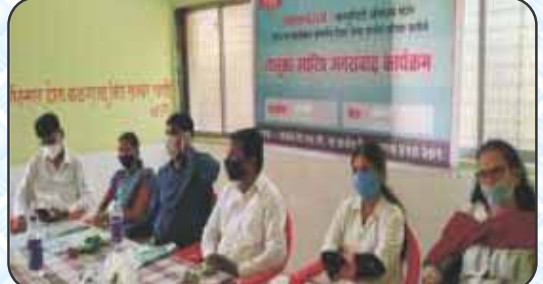
DISHA Kendra Karjat, Block JANSAMVAD at Kadav Primary Health Care Center on 26/3/2021