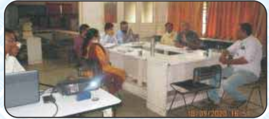
STAPI Team during the aftercare programme support service for young adult orphans discussions with the Officials of Maharashtra State Probation and Aftercare Association at STAPI on 18/9/2020